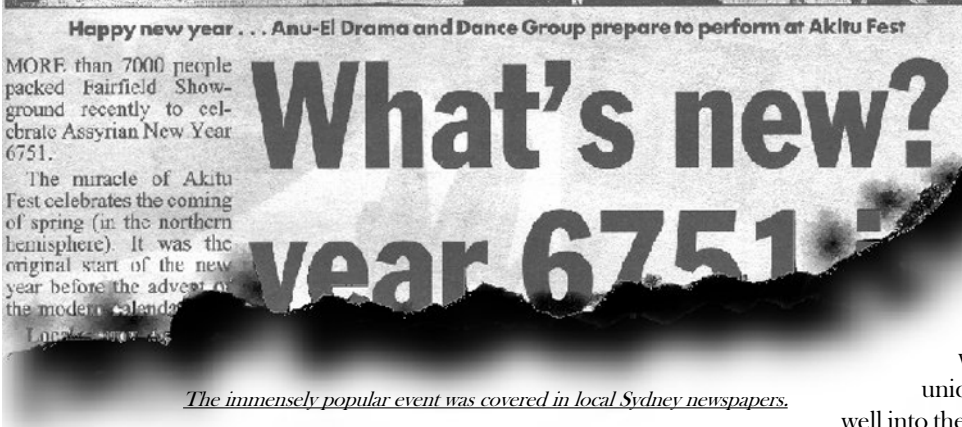
The immensely popular event was covered in local Sydney newspapers.

Meanwhile children provided a energetic and youthful atmosphere as they threw balls to each other playing games such as volleyball and chasing each other in energetic games of tag, which could be seen by all.